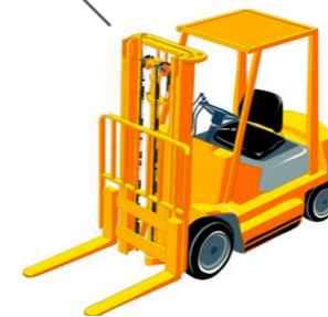
Smart Engine for Pick-Pack-Ship