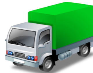
Stock in Transit