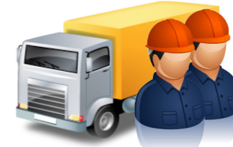
Despatch and Delivery