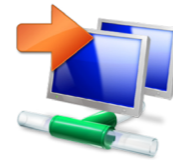
Batch Import / Export CSV and Excel